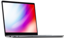
Framework laptop shown with its repair score 9.7 of 10.

Drilling down further into the five different categories represented in the French score provides additional insight into where manufacturers excel or lag in terms of supporting repair.